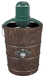
Item #2077 We All Scream for Icecream!!, 7 th Grade Classes