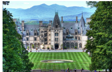
Item #2007 Biltmore Estate Getaway, 8 th Grade Classes