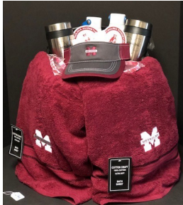
Item #2066 Chillin ' MCA Style, 6 th Grade Classes