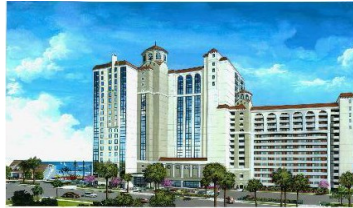
Item #2035 & 2036