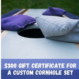
Item #2011 Custom Cornhole Set 4 th Grade Class