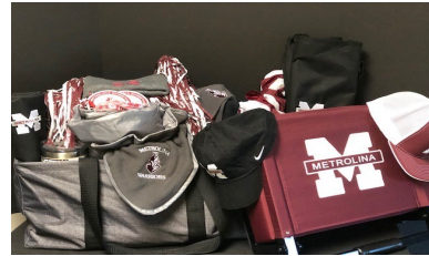
Item #2067 MCA All Seasons Athletic Survival Kit, 6 th Grade Classes